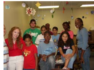
Summer program fun & games