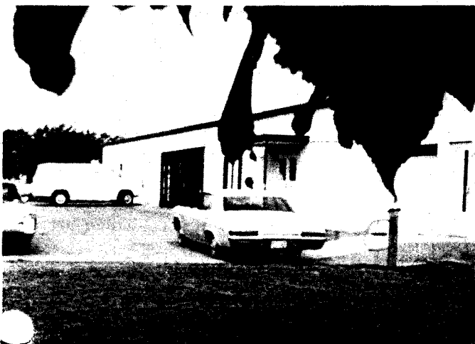
The New Casa Building