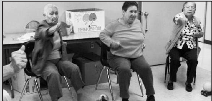
Two employees of Calvert Home Health Care test seniors for cholesterol, left, while other seniors exercise together.